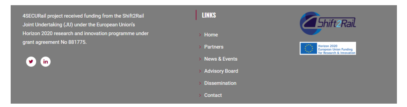
Figure 2 – Website Footer (static)